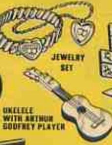
ONEELEE WITH ARTHUR GODFREY PLAYER